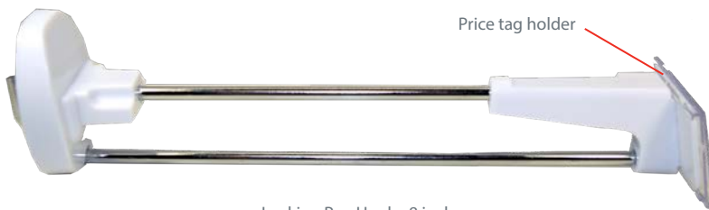
Locking Peg Hook - 8 inches