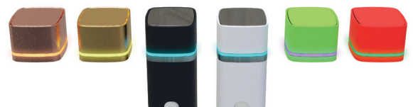
Multiple Trim Color Options