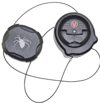
S3vx 2 Alarm Mini Spider Wrap

Housewares Coffee makers Portable DVD players iPods Digital photo frames Mobile phones Video game hardware Software Zip drives Video games Ink and toner cartridges